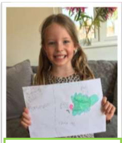
Creating a beautiful fact file about Triceratops dinosaurs!