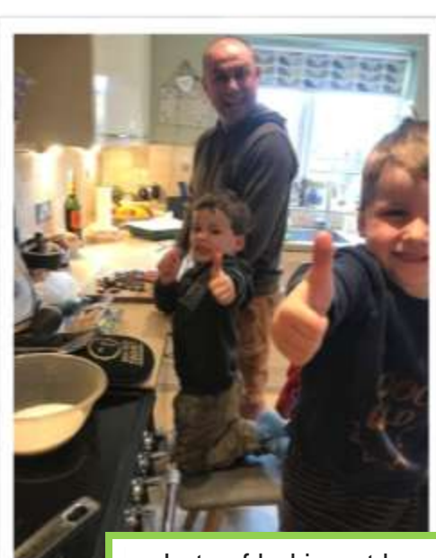
Lots of baking at home; baking lots of tasty treats.

Creating a wonderful information poster all about owls.