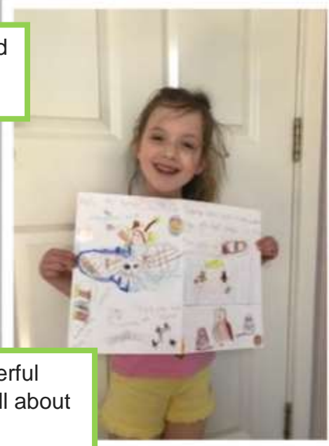
Creating a wonderful information poster all about owls.