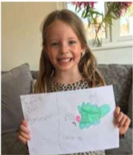
Creating a beautiful fact file about Triceratops dinosaurs!