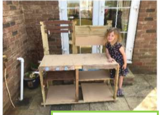
Lots of fun making a mud kitchen in the garden!