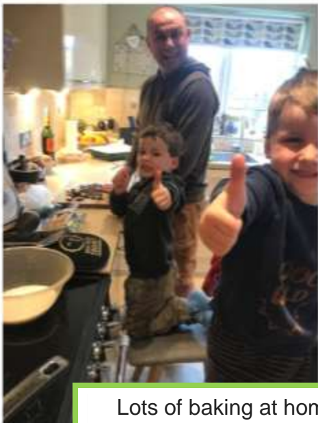
Lots of baking at home; baking lots of tasty treats.